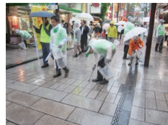
Practiced "Campaigns for Anti-Littering and Beautification" in Yokohama