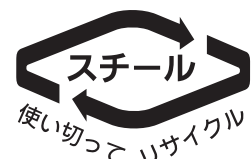
(18 Liter Cans' Mark)