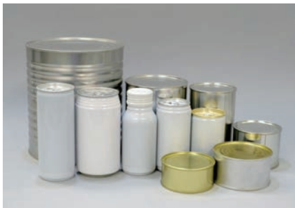
Beverage and food cans together amounted to 218,000 tons