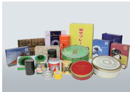
General-purpose cans 82,000 tons