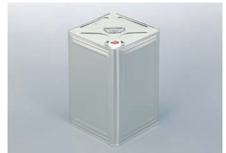
18-liter cans 26,000 tons

The data were from the Iron and Steel Statistics of 2018 published by the Ministry of Economy, Trade and Industry, and the National Federation of 18 Liter Cans Manufacturers Corporative Union.